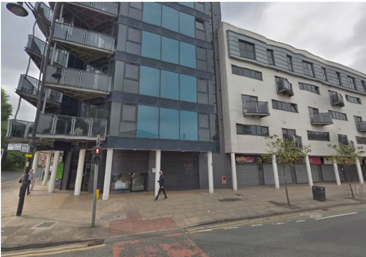
The Shop - Ice Cream Parlour Unit 3, Bishops Corner, 321 Stretford Road, Manchester, M15 4UW